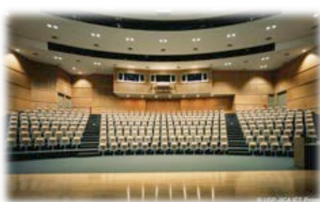
ICT Lecture Theater

Certain aspects of the conference will be broadcasted live on Ustream from the University of the South Pacific, Information Technology Services.