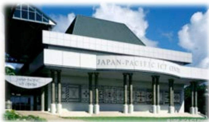
ICT Center at USP

Plenary discussion: ICT Lecture Theatre ca. 200people